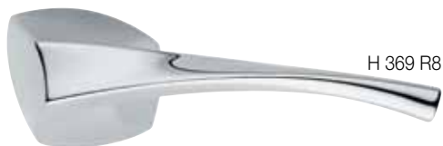
H 369 R8

Materiale Nikrall Lega Zama UNI 3717 Material Nikrall Lega Zama UNI 3717