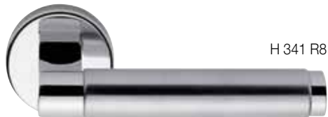
H 341 R8

Materiale Ottone e Acciaio Inox AISI 316 L* Material Brass and Stainless Steel AISI 316 L*