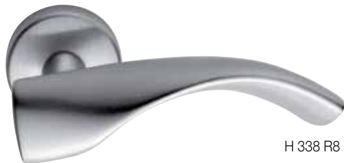
H 338 R8