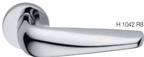
H 1042 R8