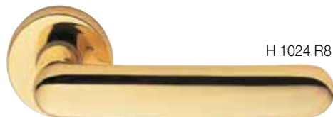
H 1024 R8