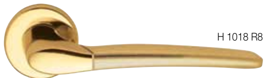
H 1018 R8