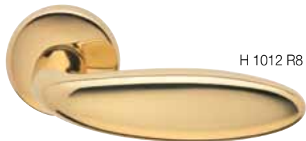
H 1012 R8