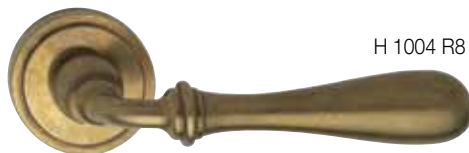
H 1004 R8