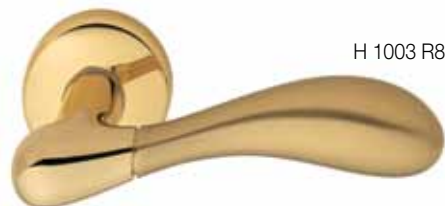
H 1003 R8