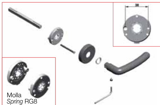
RG8 - Rosetta da 50 e sottocostruzioni con viti passanti (□ 8 / □ 8,5)

GL8 - Anchor rose for glass doors (8 mm spindle)