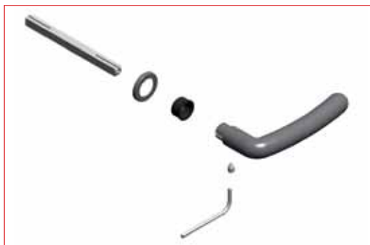
GL8 - Rosetta porte vetro (□ 8)

RO8 - Narrow anchor rose with wooden screws (8 mm spindle)