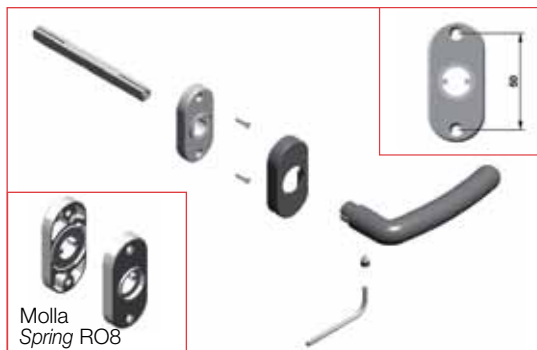
RO8 - Rosetta stretta (□ 8)

RO8 - Narrow anchor rose with wooden screws (8 mm spindle)