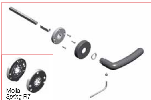
R7 - Rosetta da 50 (□ 7)

RG8 - Anchor rose for bolt through fixing (8/8.5 mm spindle)